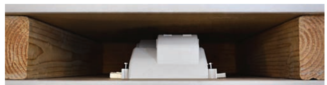
Top View - Mounted Between Studs

Flexible Screen closes interior opening of the Mid-Size Plate and Straight Blade Inlet